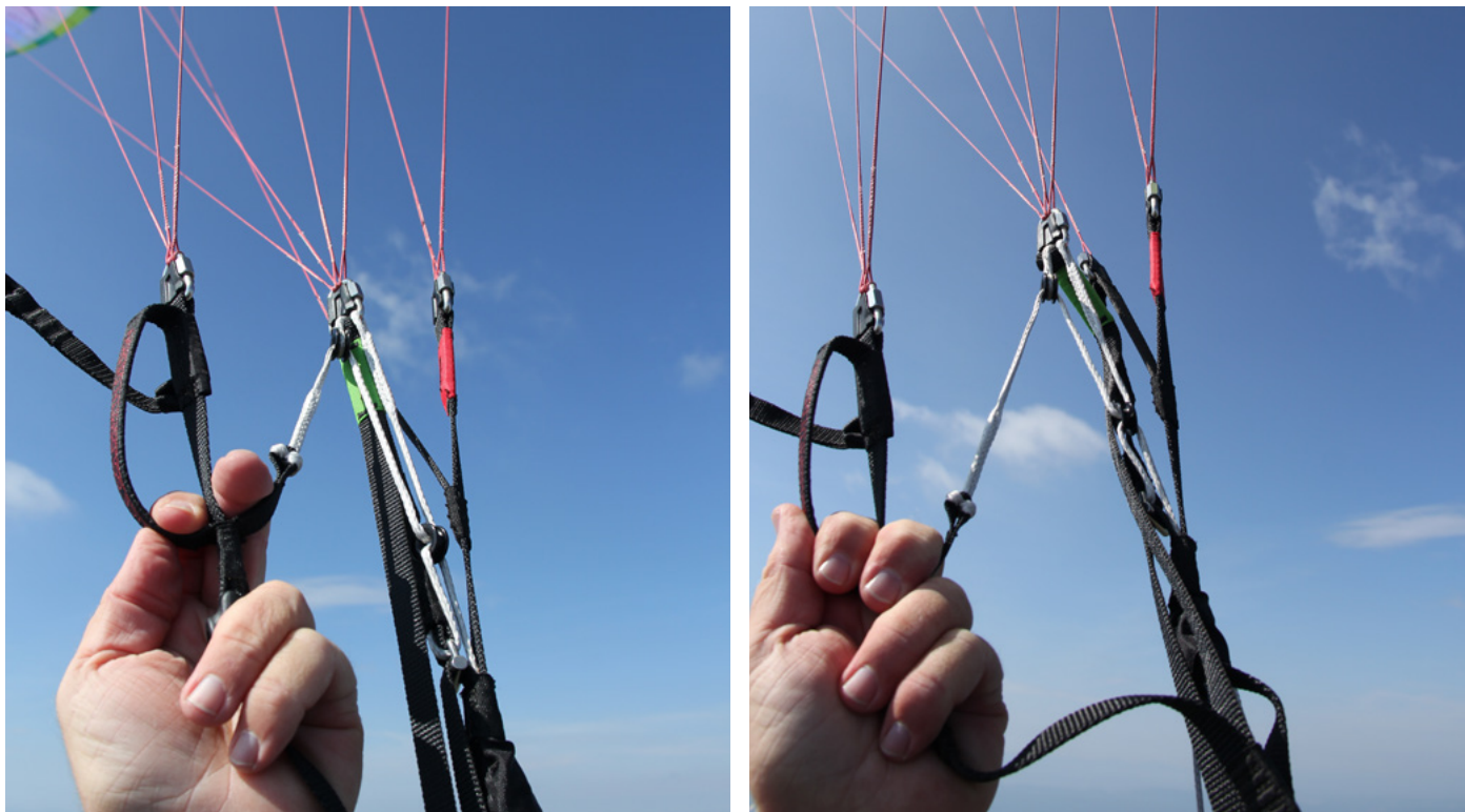
FIG. 1: To use the C-steering system, place your fingers either side of the C-riser and grasp the C-handle. Applied pressure acts on the C- and B-risers in a 3:1 ratio.